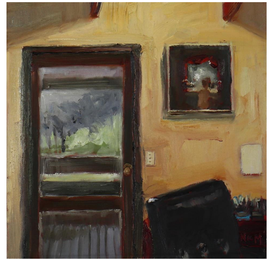
'Derek here too and always in the way' 2020; oil on board, 30x30cm box framed, $750