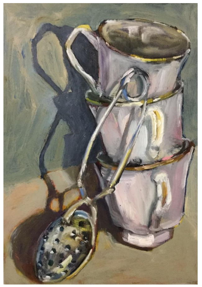
'Teacup stack'; oil on birch panel, 30x21cm unframed, $500