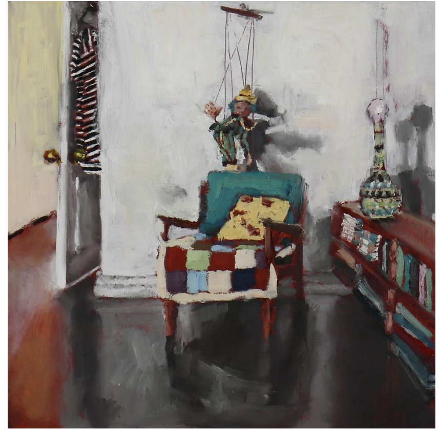
'Puppet Memories' 2020; oil on board, 30x30cm box framed, $750