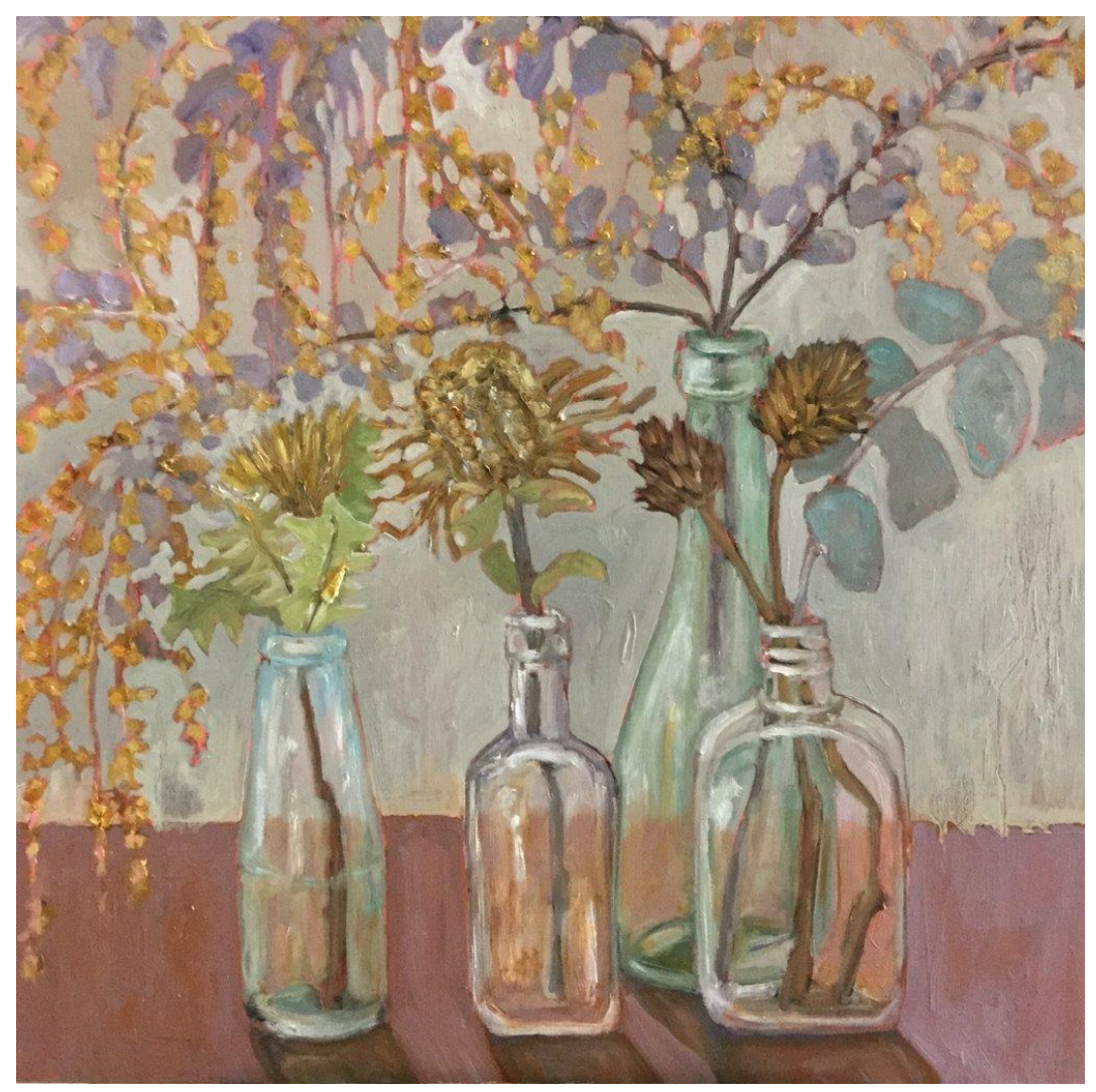
'Dried flowers'; oil on birch panel, 50x50cm framed, $1,100