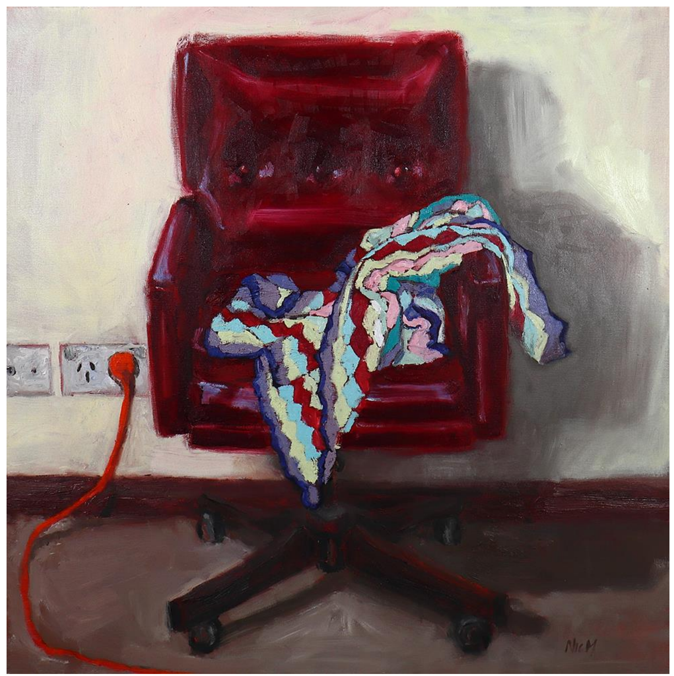
'The blanket' 2020; oil on canvas, 76x76cm unframed, $1,605