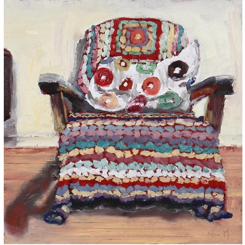
'The chair' 2020; oil on board, 30x30cm box framed, $750