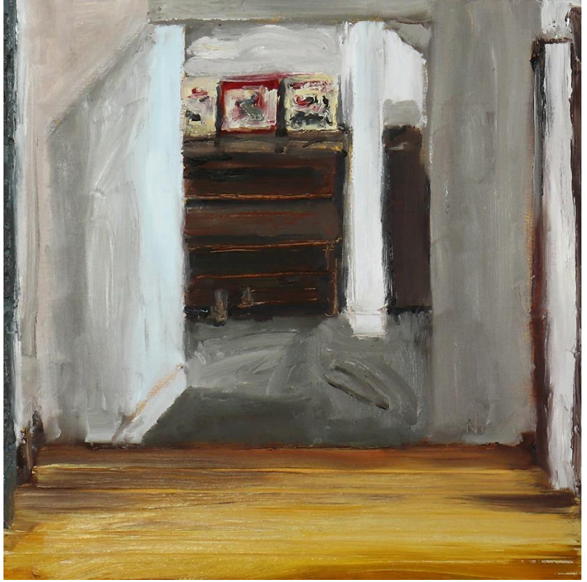
'Down and around' 2020; oil on board, 30x30cm box framed, $750