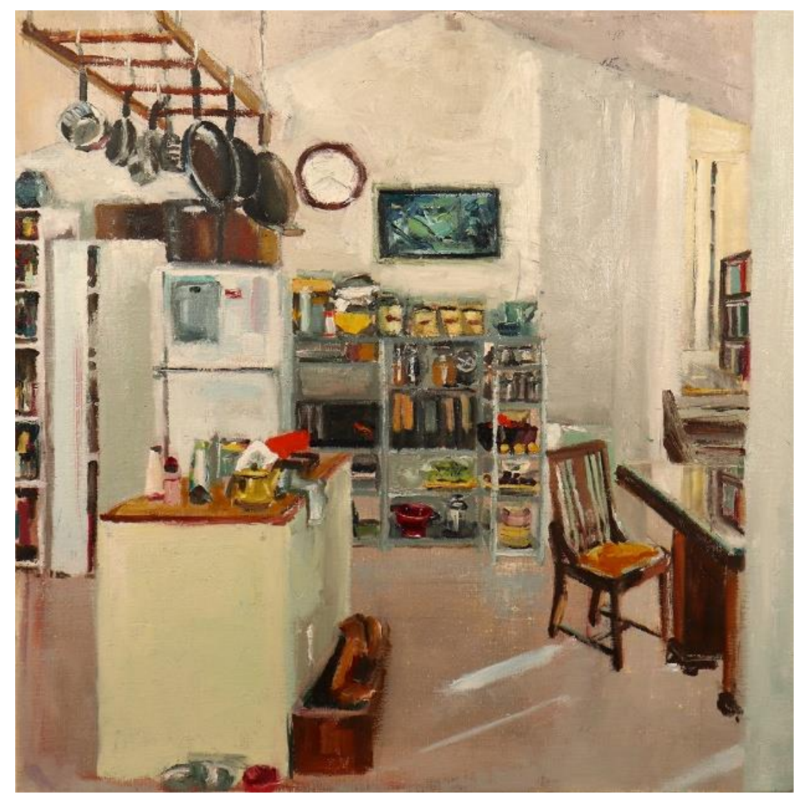
'Always open' 2020; oil on canvas, 60x60cm box framed, $1,350