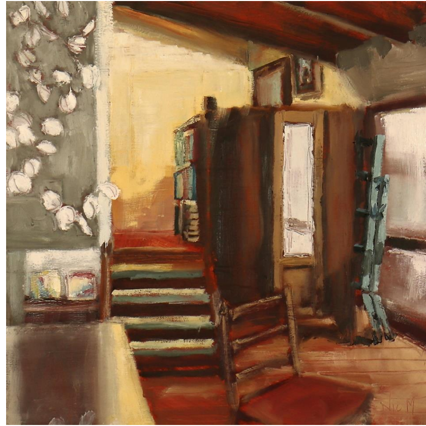
'The blue ladder' 2020; oil on board, 30x30cm box framed, $750