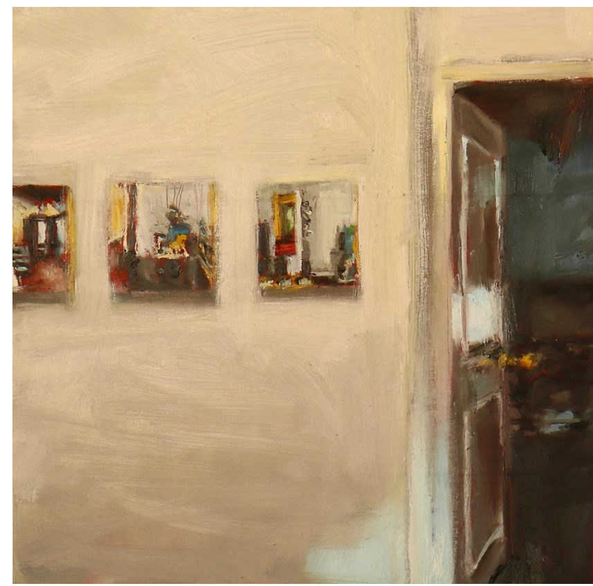
'Beyond' 2020; oil on board, 30x30cm box framed, $750