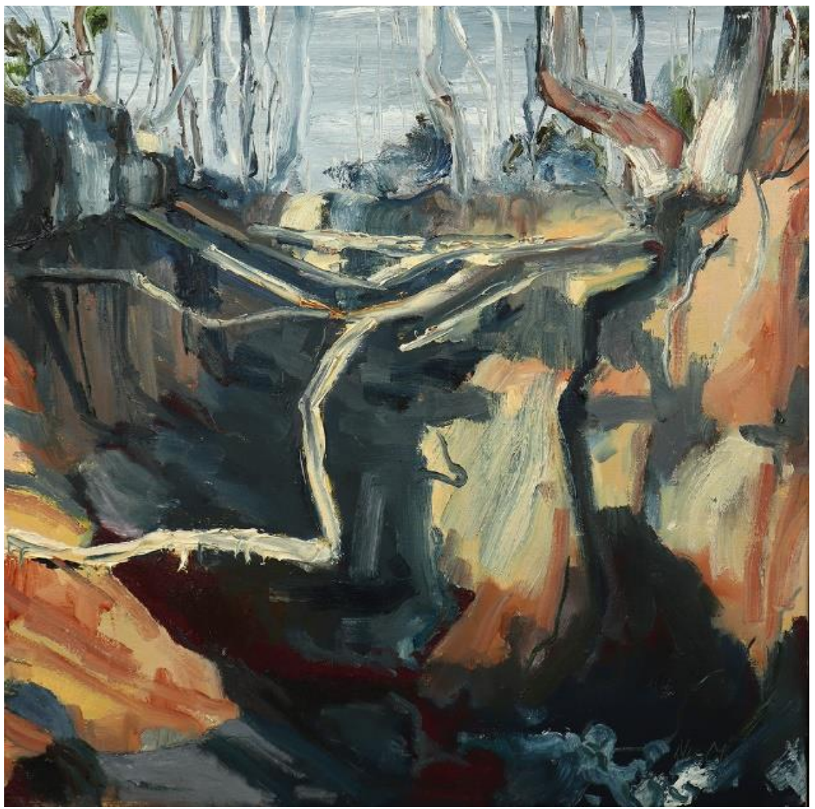
'Holding ground' 2018-20; oil on canvas, 60x60cm box framed, $1,350