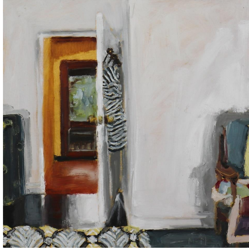
'Rich Light Invite' 2020; oil on board, 30x30cm box framed, $750