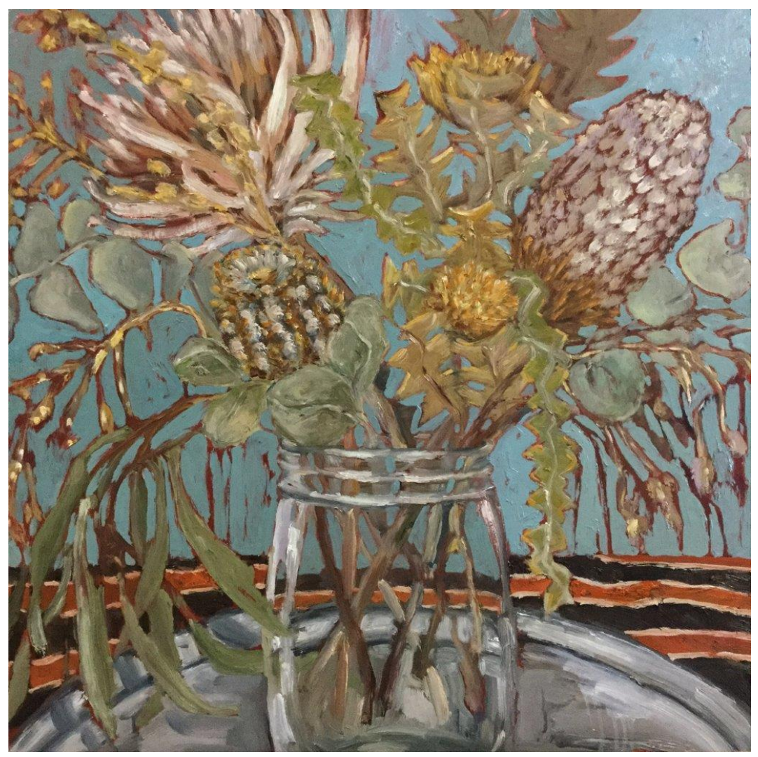
'Blue sky flowers'; oil on birch panel, 50x50cm framed, $1,100