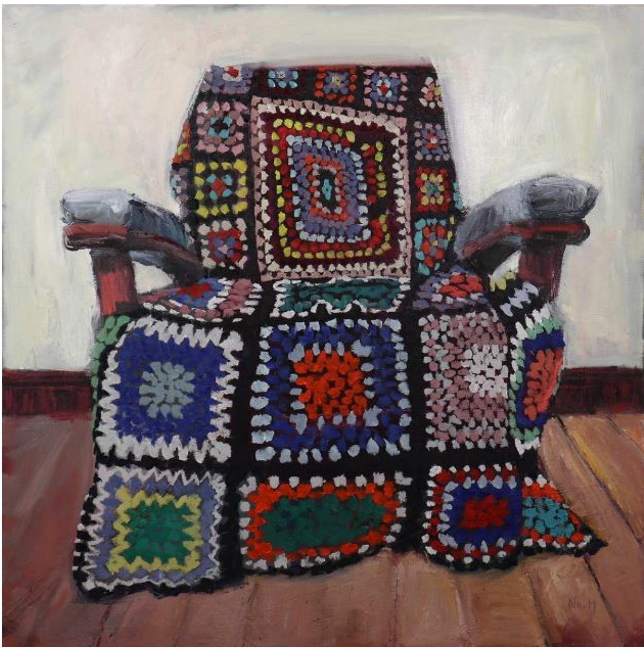
'Nanna blankets on the chair' 2020; oil on canvas, 76x76cm unframed, $1,605