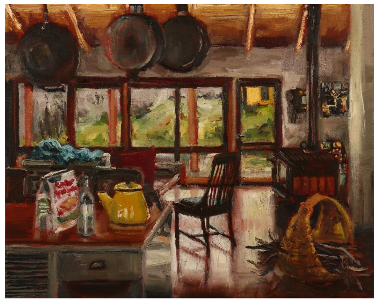
'Light coming in' 2020; oil on canvas, 40x50cm box framed, $960