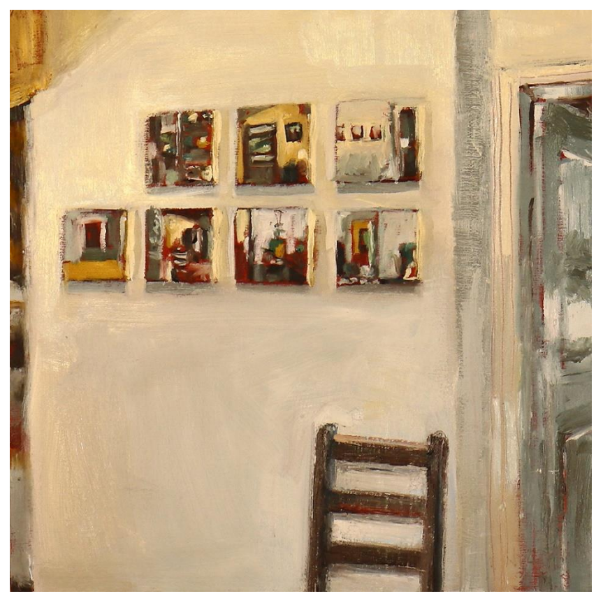
'The landing' 2020; oil on board, 30x30cm box framed, $750