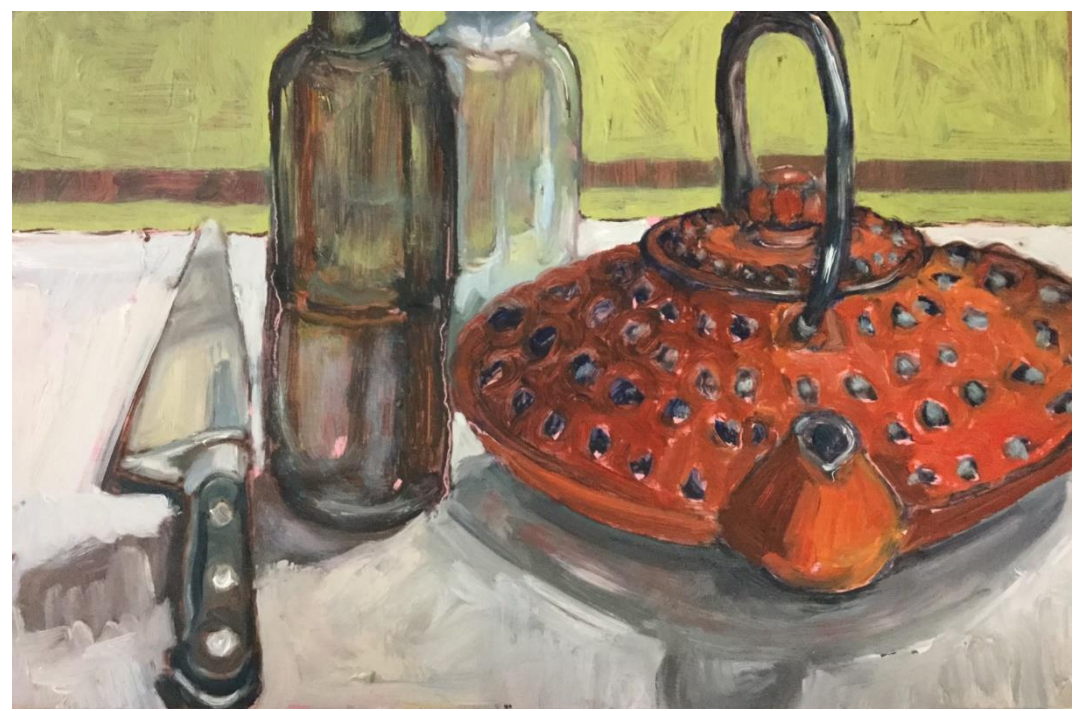
'Red Teapot'; oil on wood panel, 23x35cm unframed, $650