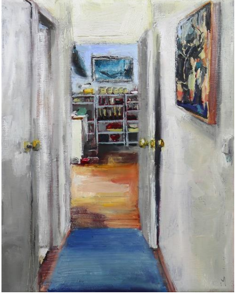
'Holding ground in the hall' 2020; oil on canvas, 40x32cm box framed, $835