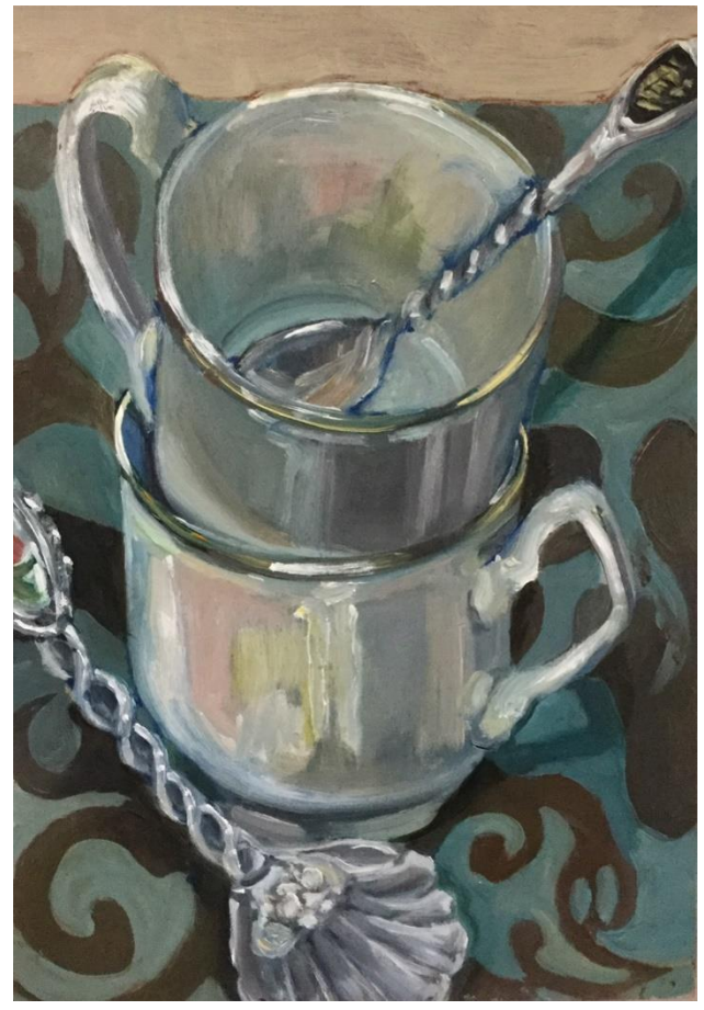
'Cups and Spoons' ; oil on birch panel 30x21cm unframed, $500